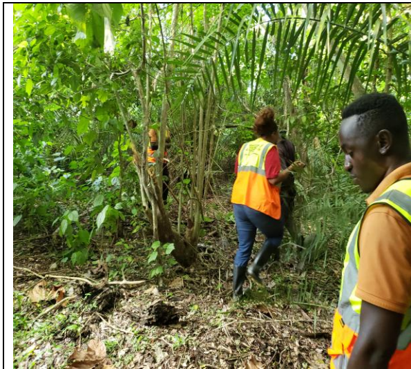
Figure 4: Site Location

The site visit assisted in identifying and assessing the likely impacts as a result of the project implementation. The site visits also assisted in establishing baselines (i.e., biological and physical) to be used in monitoring compliance of the project to the proposed mitigation measures.