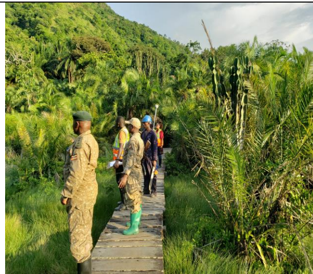
Figure 5: Engagement with Warden in Charge