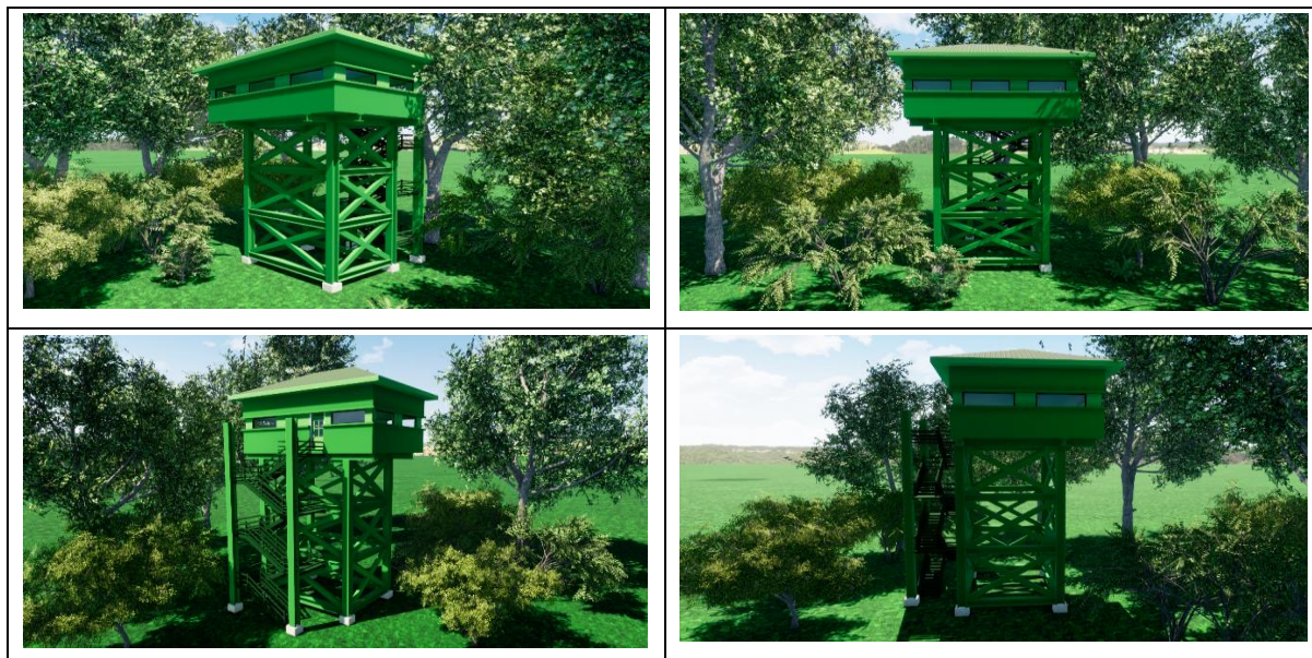
Figure 1: Bird Hide Artistic Impression

All fabrication work and installation will be done locally on site.