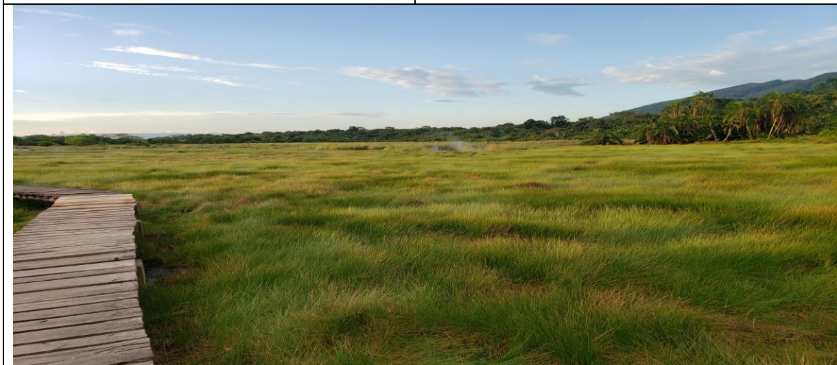
Figure 6: Front View of the Bird Hide Site