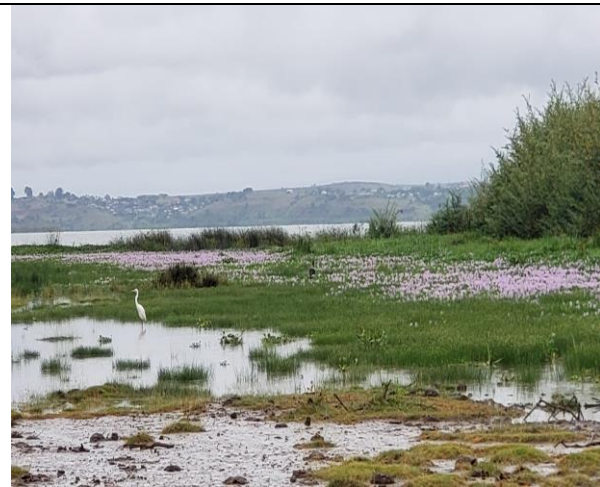
Figure 4: Bird scenery next to the Site

The site visit assisted in identifying and assessing the likely impacts as a result of the project implementation. The site visits also assisted in establishing baselines (i.e., biological and physical) to be used in monitoring compliance of the project to the proposed mitigation measures.