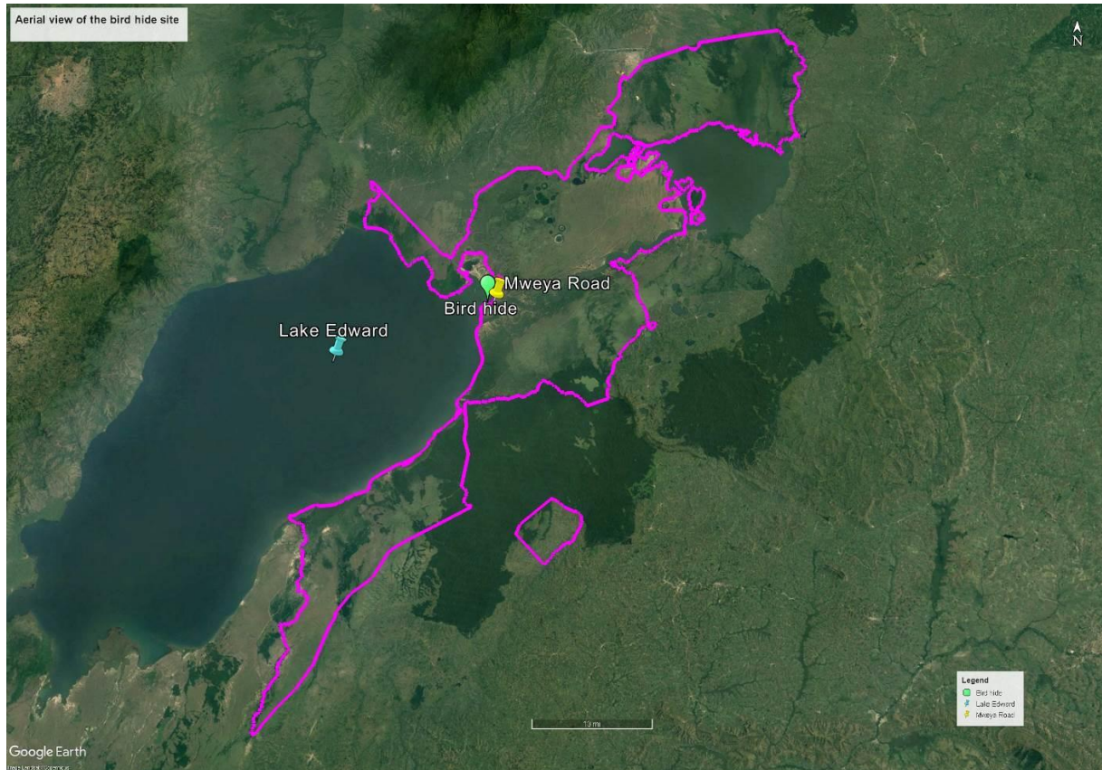
Figure 3: Location of the Proposed Site