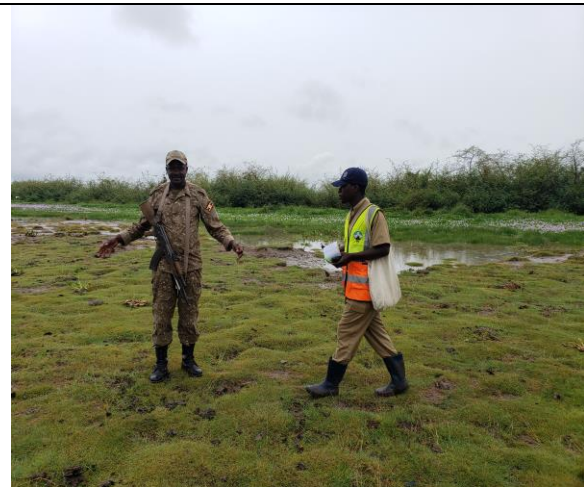
Figure 5: Engagement with UWA Rangers