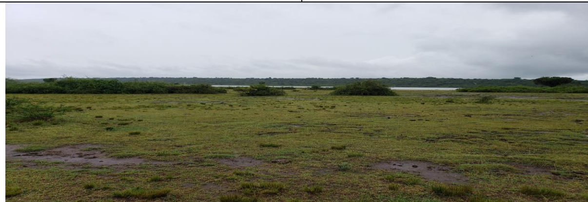
Figure 6: Site location