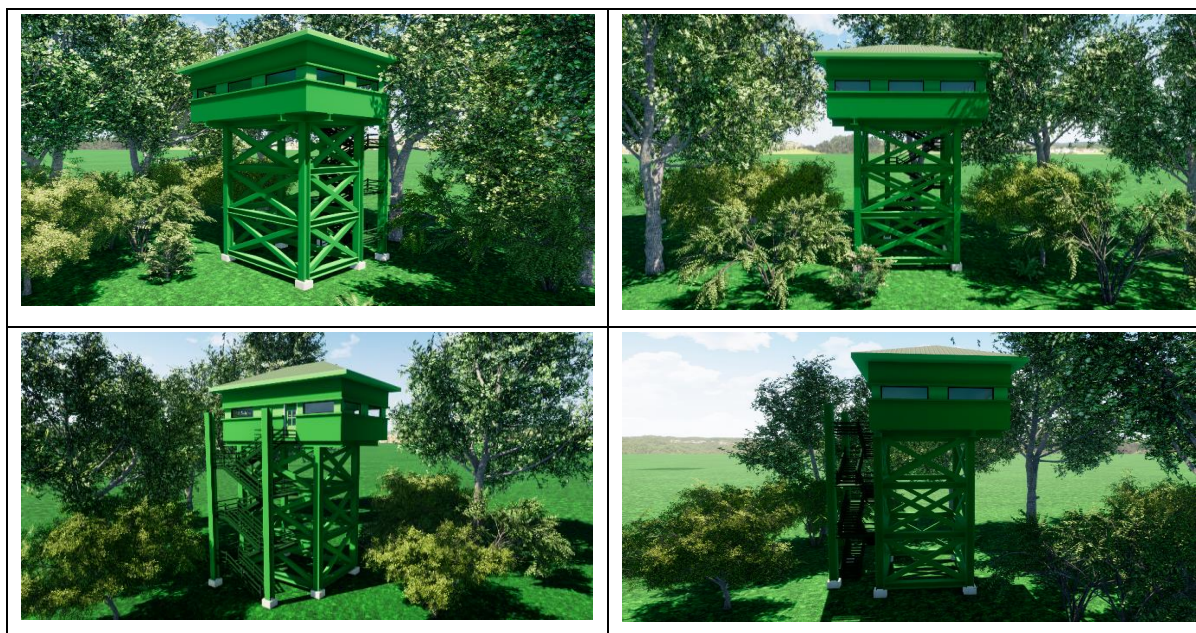
Figure 1: Bird Hide Artistic Impression

All fabrication work and installation will be done locally on site.