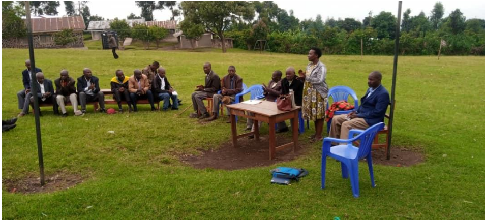
Figure3.Engagement meeting at Gisozi primary school for village representatives.