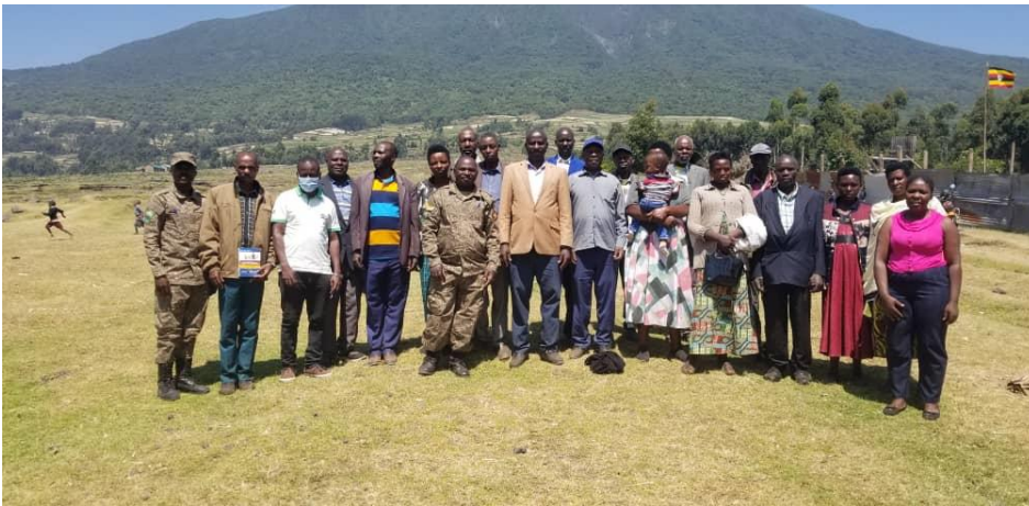
Figure 1&2. Frontline village representative of Rukongi and Gitenderi parishes from Nyarusiza sub county at Rurembwe primary school after engagement meeting.