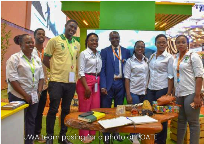
UWA team posing for a photo at POATE