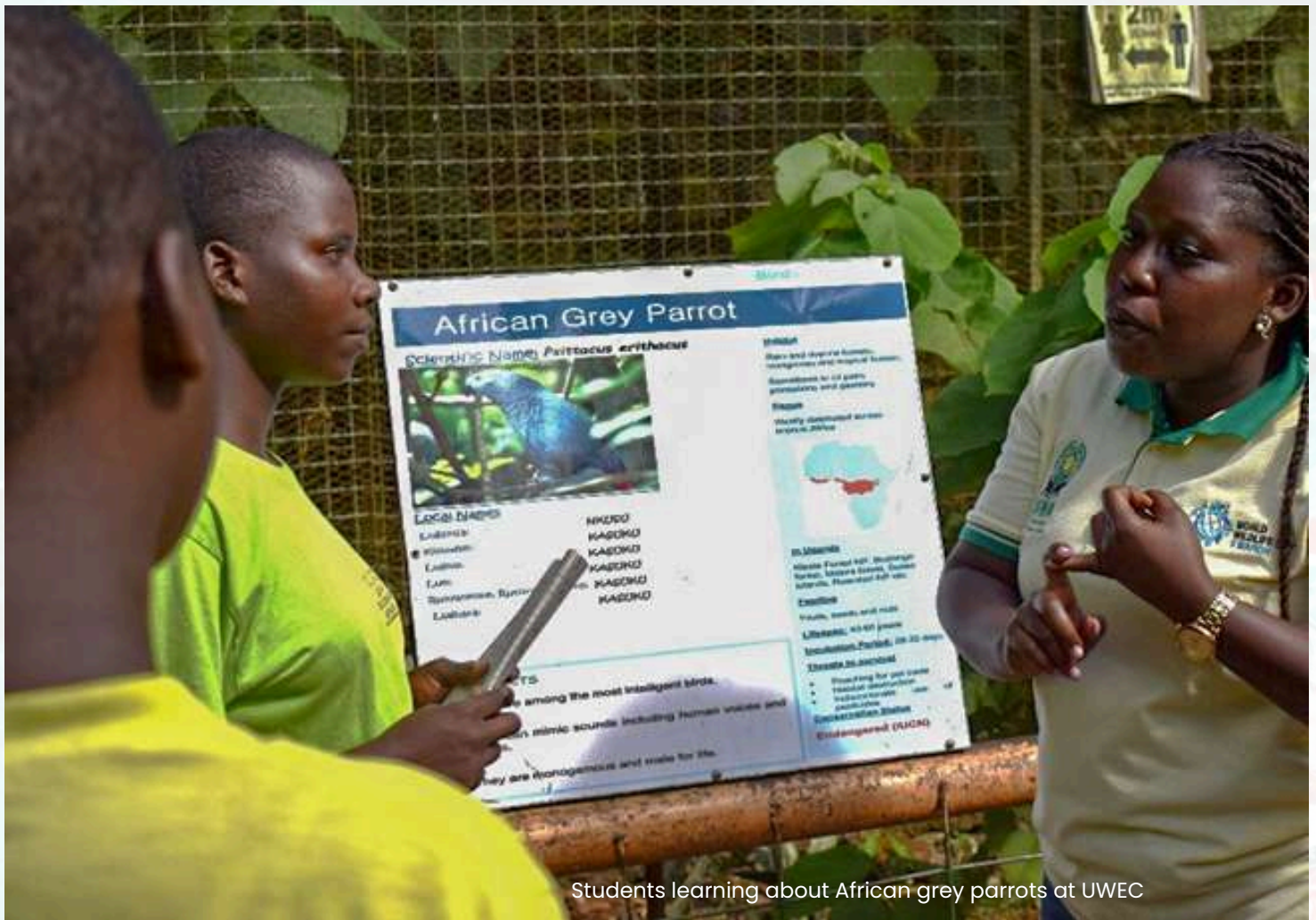
Students learning about African grey parrots at UWEC

emphasized the importance of planting trees, particularly fruit trees, and enforcing laws against the trafficking of this bird, which is among the most trafficked species in the world.