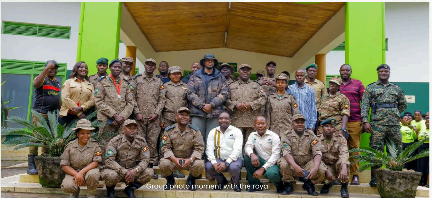
Group photo moment with the royal

As King Oyo and his entourage left Bwindi, his visit left more than just footprints on a forest trail. It reinforced the idea that Uganda’s protected areas are not only environmental treasures—they are places of learning, pride, and unity.