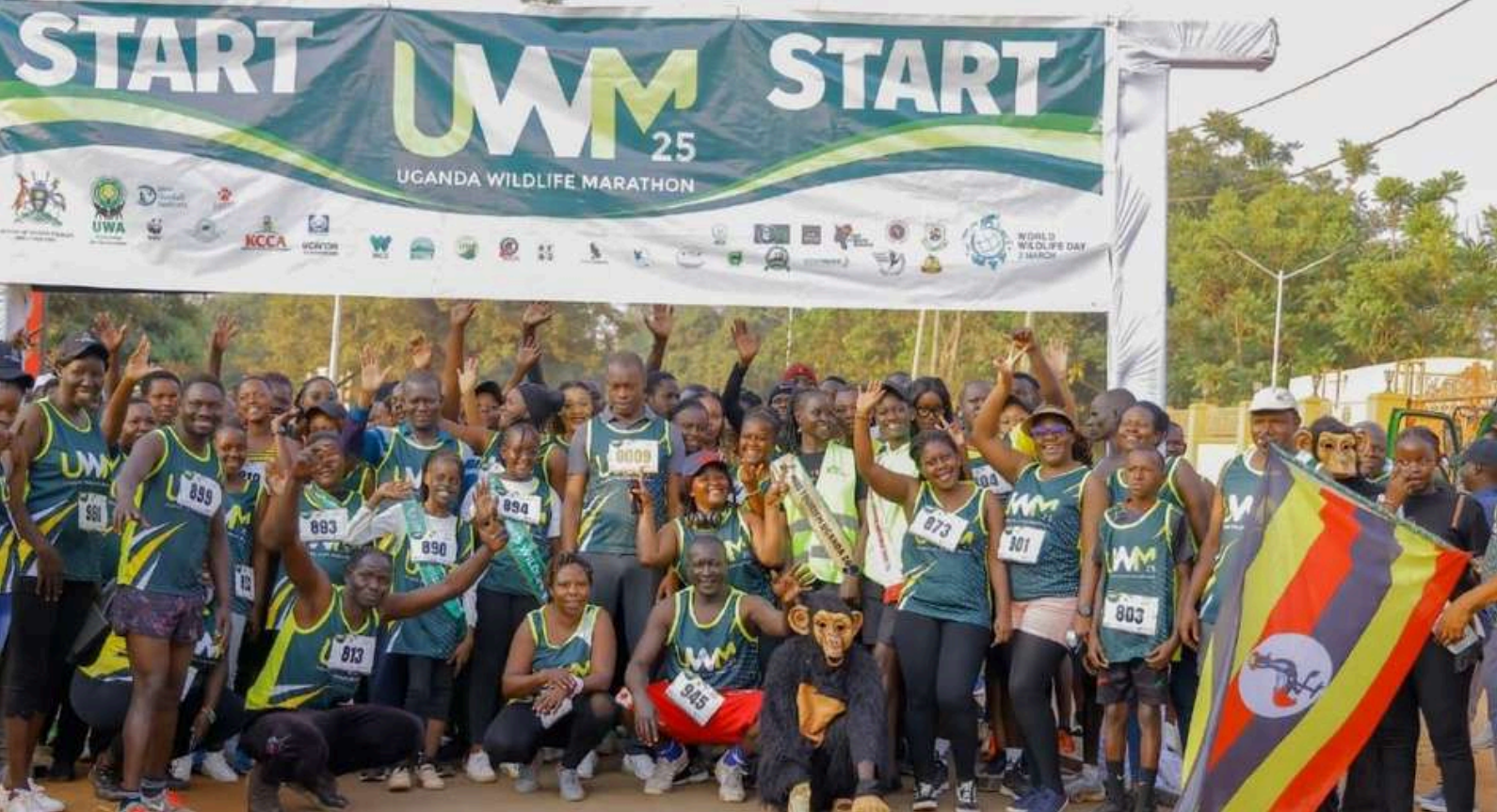
UWM25 participants pose with excitement before the official flag-off by Hon. Martin Mugarra