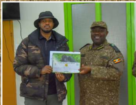
King Oyo treks Bwindi, adds royal spotlight to gorilla conservation