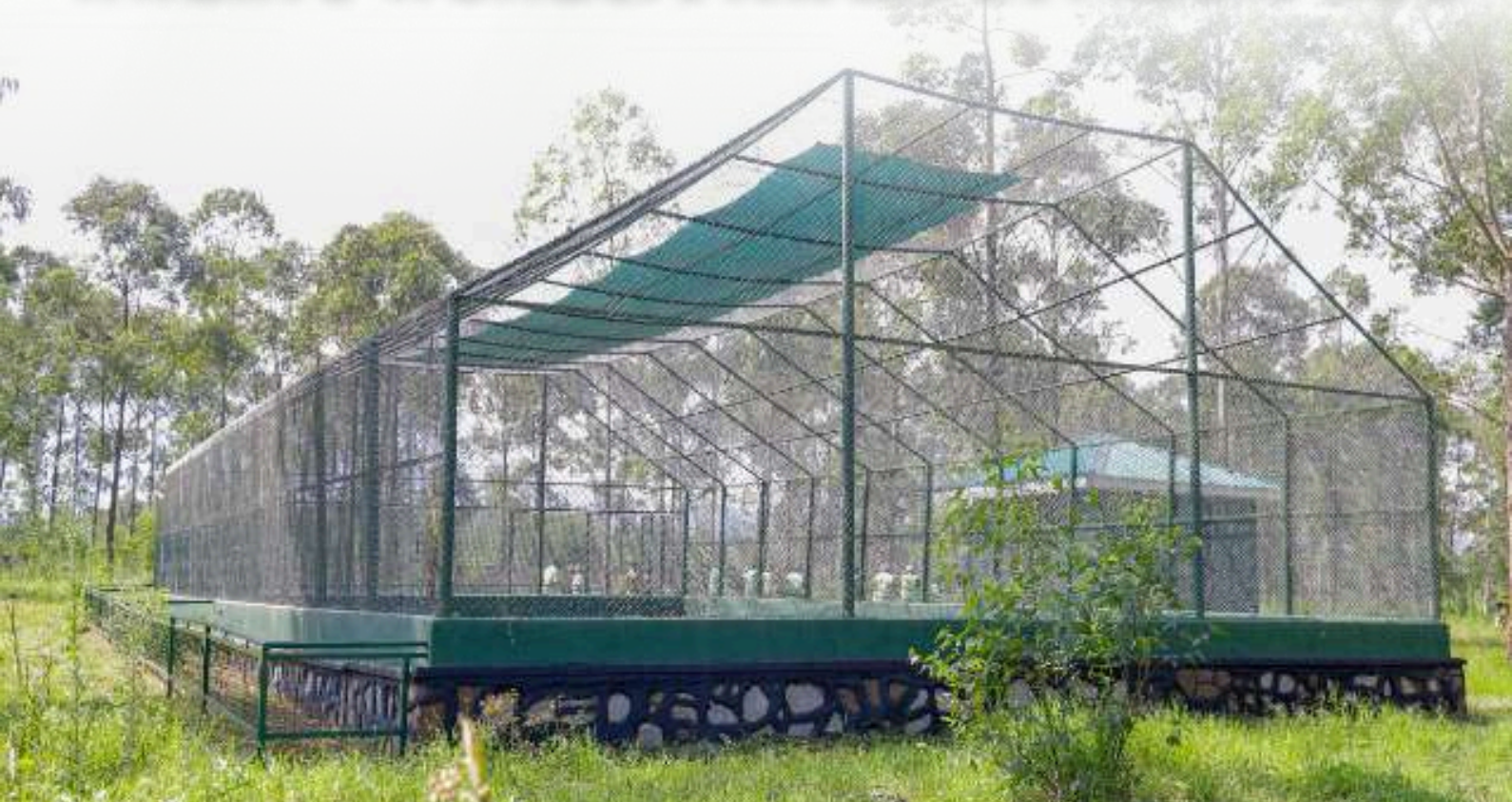
Constructed animal holding facility at Mbale satellite zoo

A new conservation landmark is taking shape in Eastern Uganda. The Mbale Zoo, a facility under the Uganda Wildlife Conservation Education Centre – Conservation Area (UWEC-CA), is now 80% complete and is already drawing attention as a major addition to the region's education and tourism infrastructure.