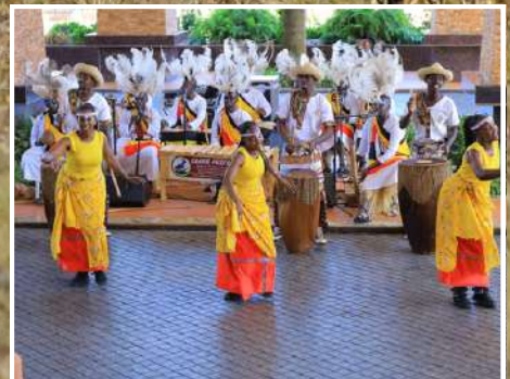
From Culture to Conservation: Uganda Shines at POATE 2025