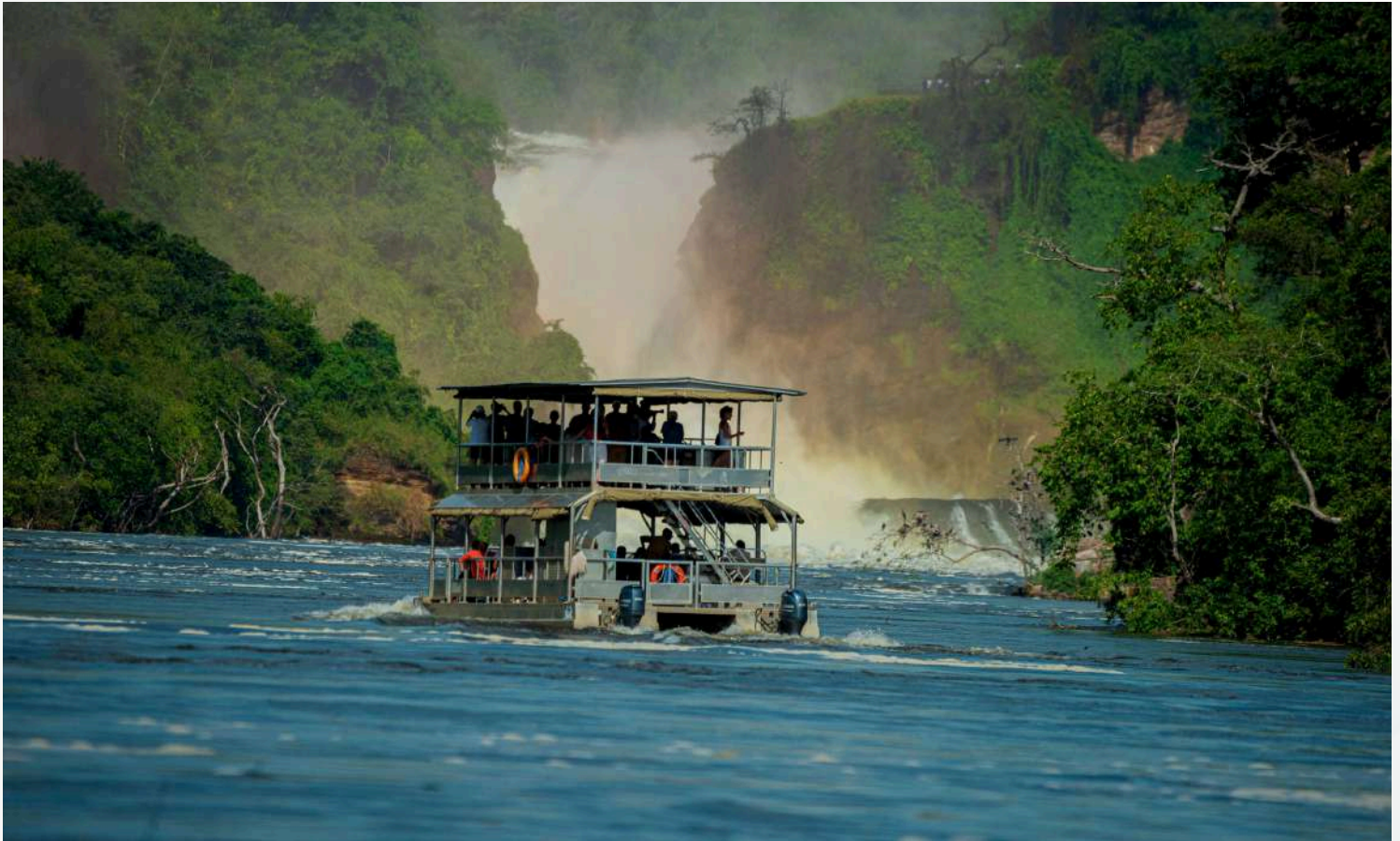
Tourists Enjoying a Boat cruise on the River Nile in Murchison Falls National Park

One of the key highlights, in UWA's plan is to roll out a fully cashless payment system across all protected areas, that will ease transactions, improve security and streamline tourist experiences, boost efficiency, and improve security.