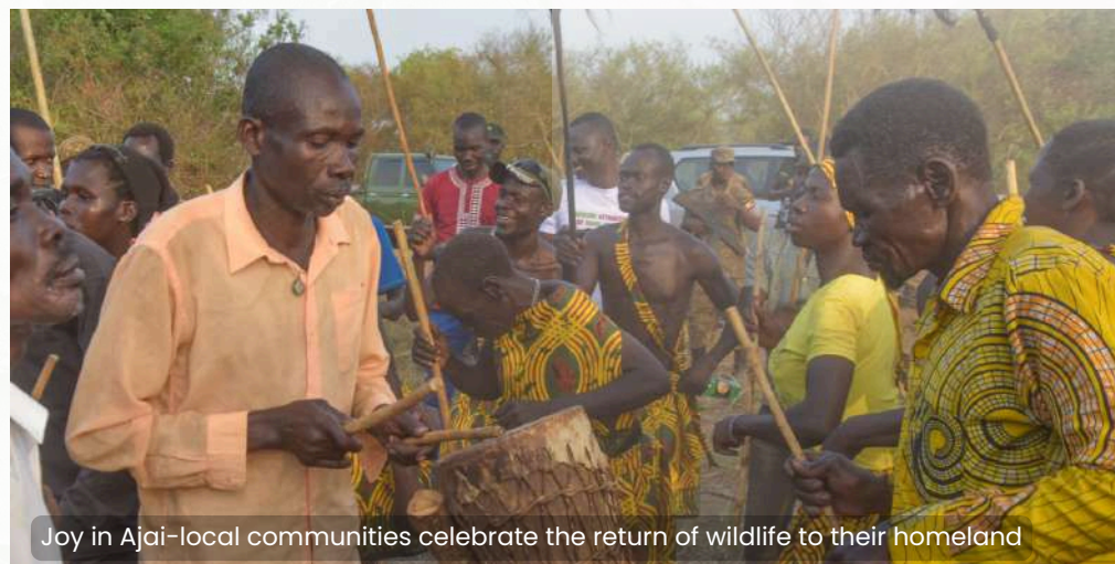
Joy in Ajai—local communities celebrate the return of wildlife to their homeland

History has it that the former President Theodore Roosevelt of the United States of America (USA) visited in King Ajai's palace during his African expedition in 1910, and during that time he hunted several White Rhinos, which drastically reduced their number in the reserve and finally both Black and White Rhinos went extinct in Uganda in 1983.