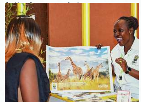
UWA staff engaging a client during POATE

conservationists, and international travel writers united by a common goal: to showcase Uganda through their perspectives. This storytelling initiative was not merely symbolic; it was a strategic move to empower locals to document and share their experiences, paving the way for a new era of grassroots tourism that is authentic, inclusive, and