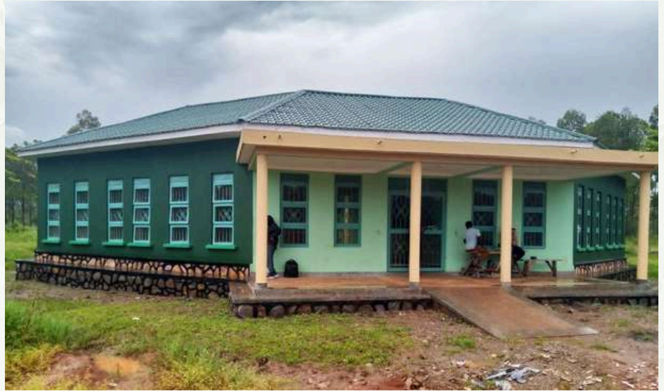
Nearing completion: Office building at Mbale satellite zoo

The zoo is expected to provide jobs for locals, both during construction and once it opens. Guides, maintenance crews, educators, food vendors, and security staff will all find opportunities here. Local communities will also benefit from increased traffic through the region, creating new markets for crafts, transport services, and small businesses.