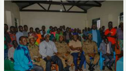
UWA staff with Apala B community members in a renovated classroom

For Apala B Primary, the support is more than charity. It's a signal that conservation institutions can be allies in improving lives, not just managing parks.