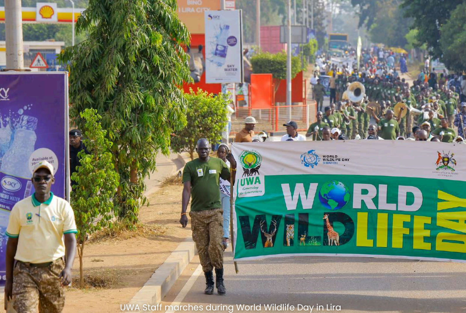
UWA Staff marches during World Wildlife Day in Lira