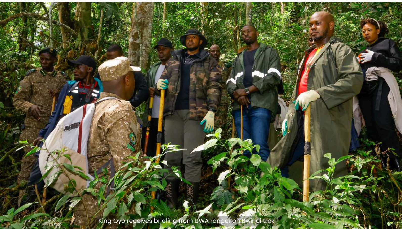
King Oyo receives briefing from UWA ranger on Bwindi trek

His Majesty's trek led him to the Nyamishamba area, where he encountered the Binyindo gorilla family. Standing in respectful silence just metres away from the silverback and his group, the King reflected on the rare privilege of such an encounter.