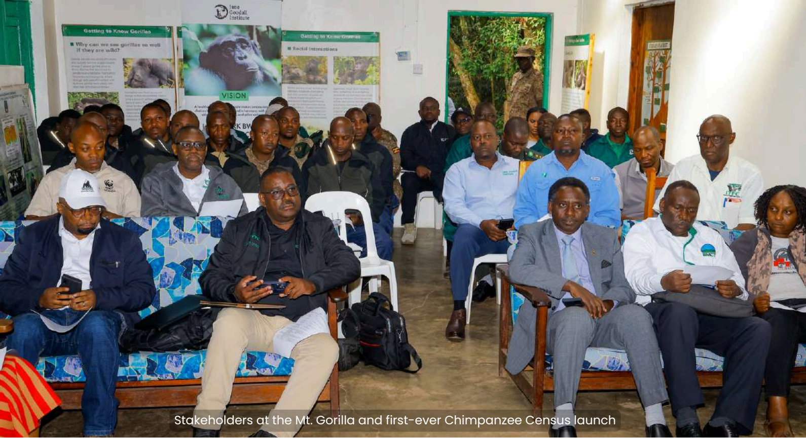
Stakeholders at the Mt. Gorilla and first-ever Chimpanzee Census launch

The census is supported by over ten partners, including the Rwanda Development Board, Institut Congolais pour la Conservation de la Nature, Jane Goodall Institute, WWF Uganda, Gorilla Doctors, and the International Gorilla Conservation Programme. Each organization brings different resources and expertise to support field teams, data analysis, and training.