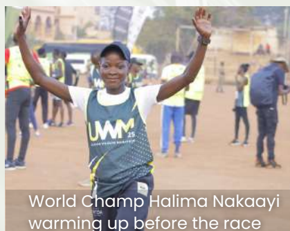
World Champ Halima Nakaayi warming up before the race