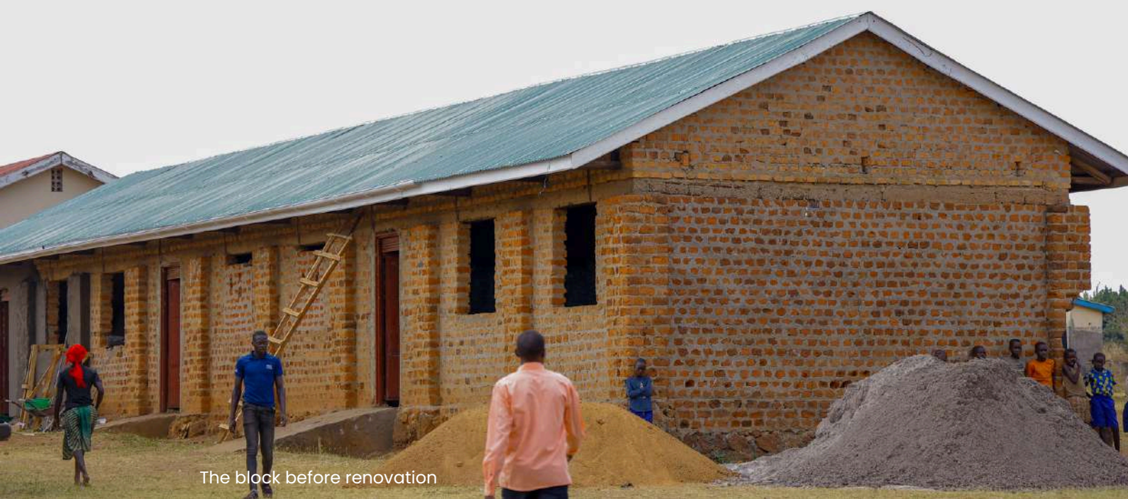
The block before renovation

As classes resume and pupils return to cleaner, brighter classrooms with new books in hand, the school's story has become one of resilience and renewal—with conservation at its core.