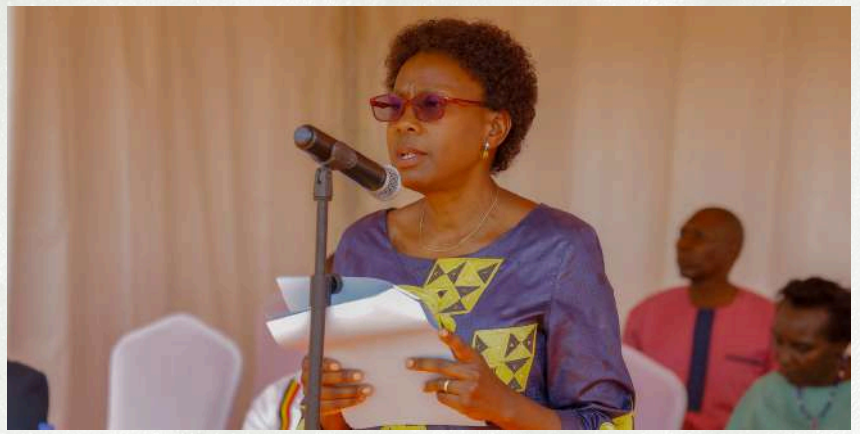
Dr. Ruth Aceng delivers her speech during the World Wildlife Day 2025