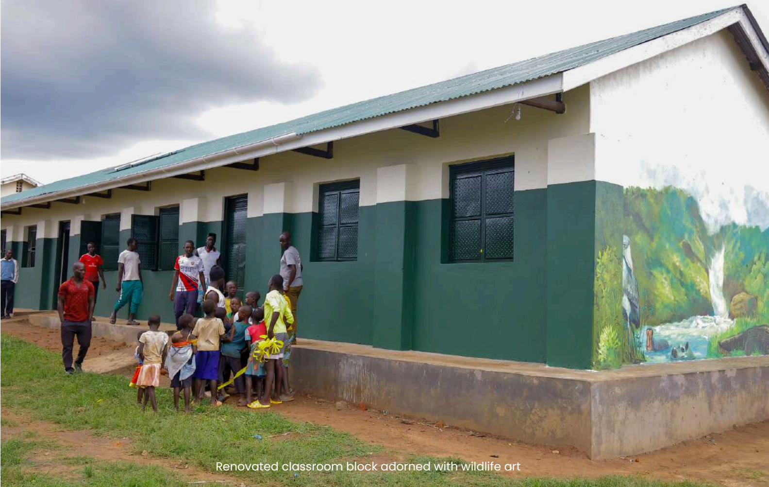
Renovated classroom block adorned with wildlife art