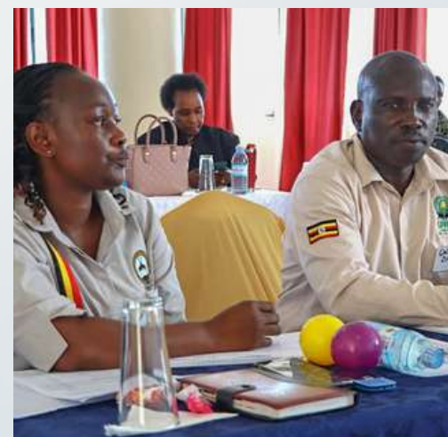
Participants listening attentively during assembly

The assembly featured capacity-building sessions facilitated by leadership development firm Coach Africa, focusing on unity, critical thinking, and collaborative leadership. The assembly was designed to equip wardens with the skills needed to lead Uganda's conservation and tourism efforts effectively.